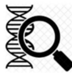
Genetic Testing Fraud