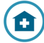
Home Health Fraud