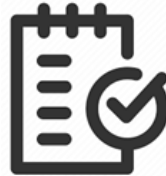
Plan of Care