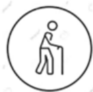
Durable Medical Equipment Fraud